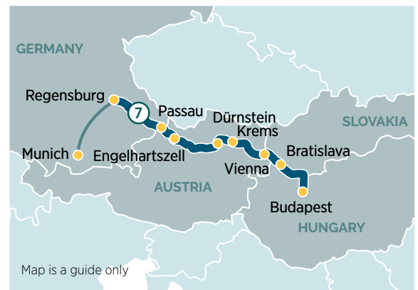
Map is a guide only ⑦ Number of nights — River cruise — Coach transfer